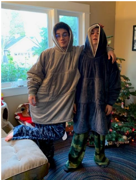
< My son and new son☺ showing off their new snuggles!