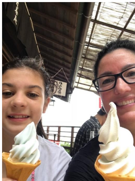
< Both my kids have been in Japanese Immersion since Kindergarten. I went to Japan with both of them after 5 th grade. Here my daughter and I are on the top of Mt. Inarisan, which the hike takes you through the Fushima-Inari Taisha Shrine